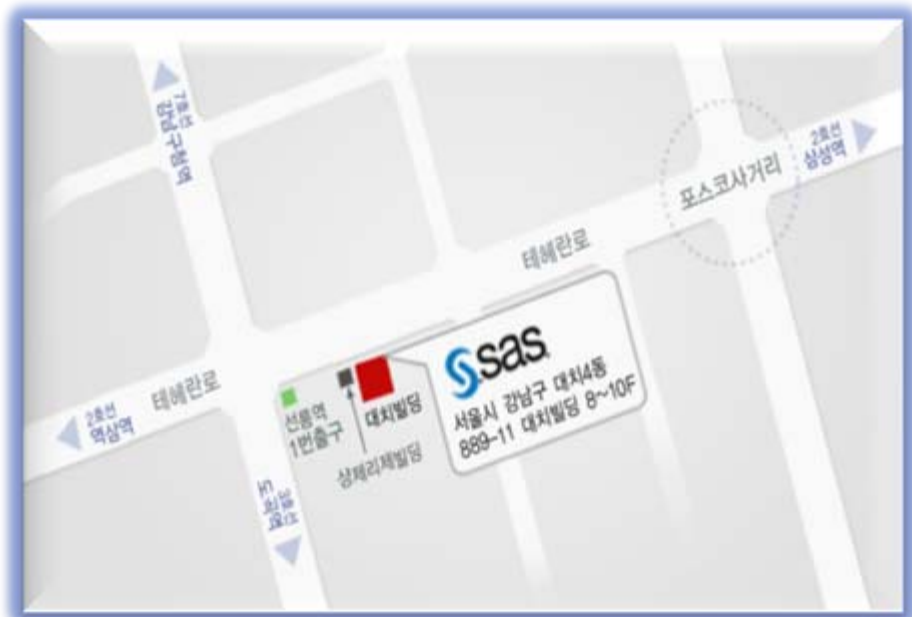
서울시 강남구 대치 4 동 889-11 대치빌딩 8-10 층 (우)135-839